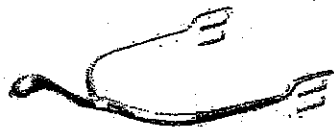
Diagram 1 Goose neck spur

"Dummy" spurs with no shanks are allowed.