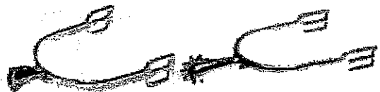
Diagram 2 Blunt or smooth daisy rowel